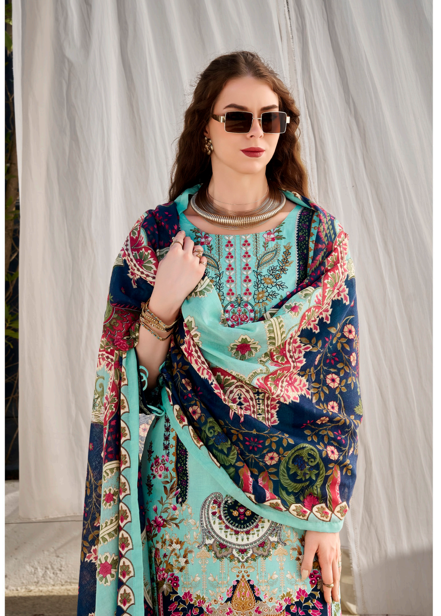
A refined look begins with balance clean lines enhance posture thoughtful details add depth.