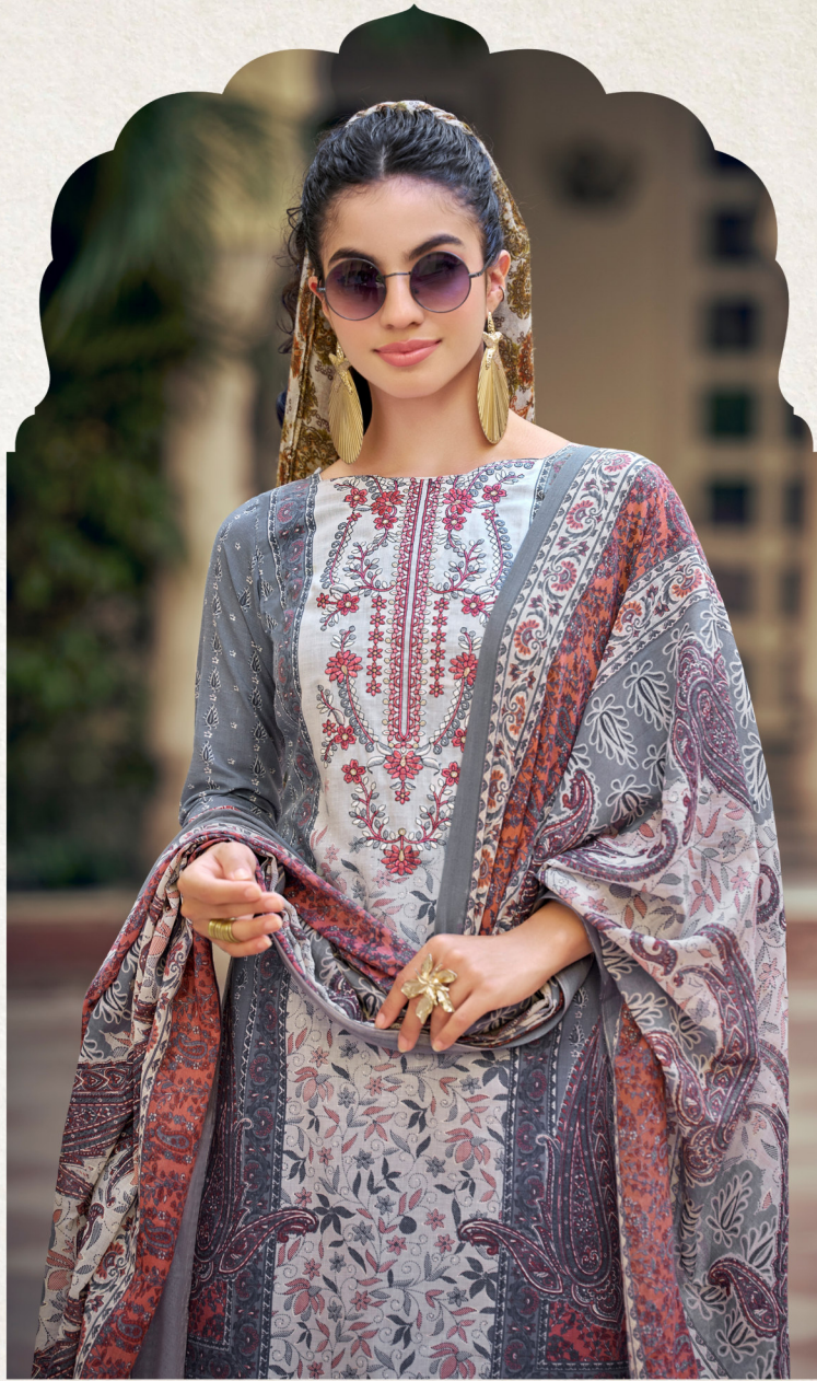
A definite trend for the wedding episode; get enthralled with detail and style!