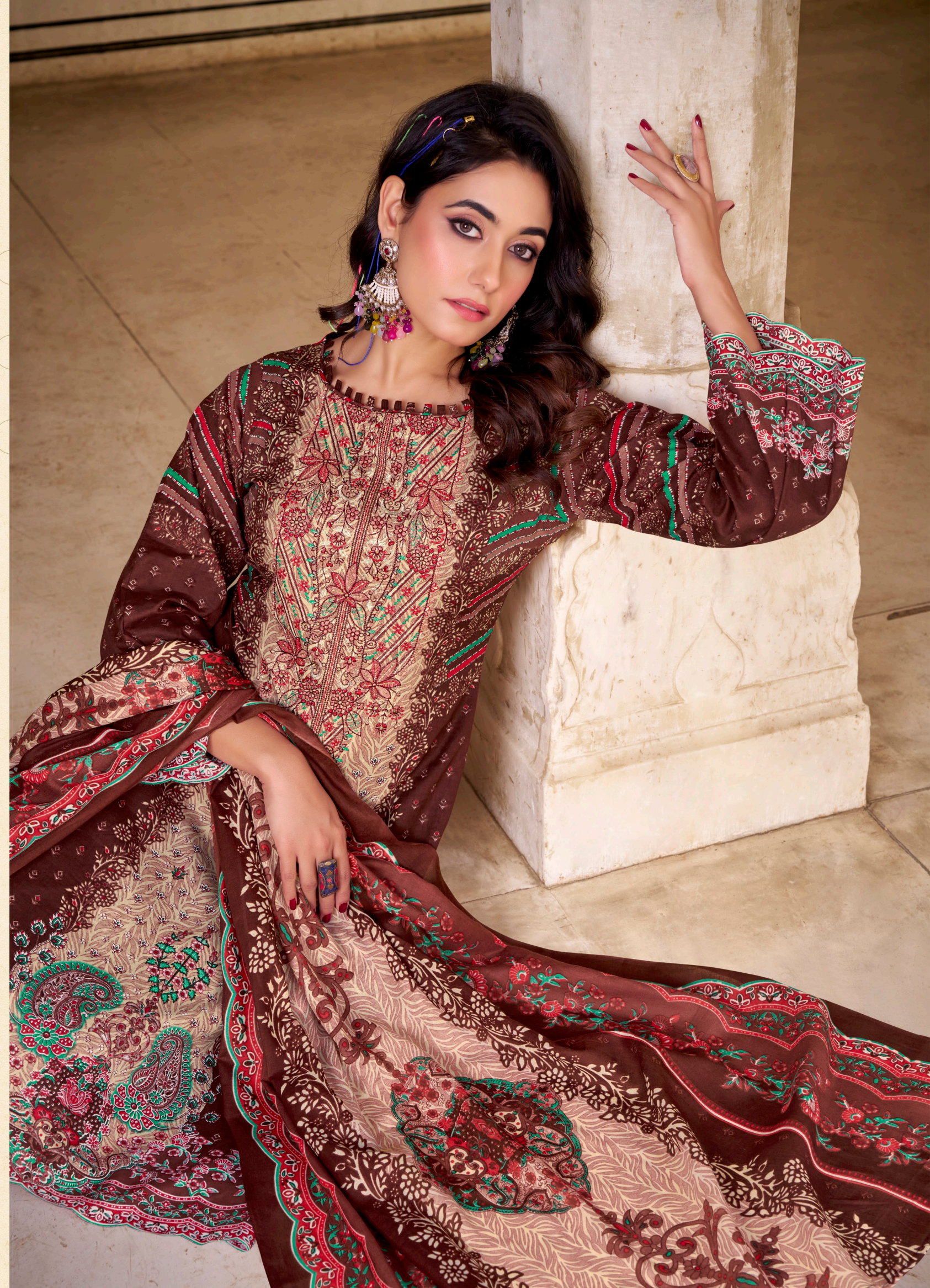
1148-008 Ethnic indian couture that defines poise and charisma at its best.