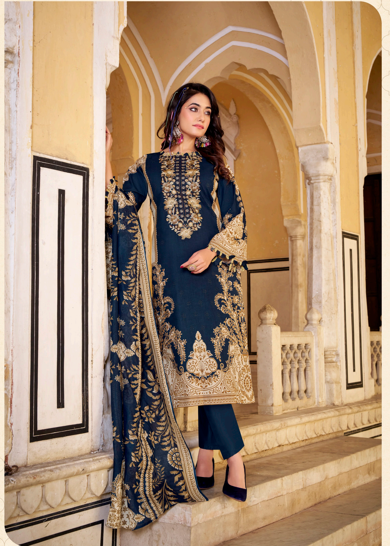
The gorgeous combination of geometrical design with young charming colours. 1148-004