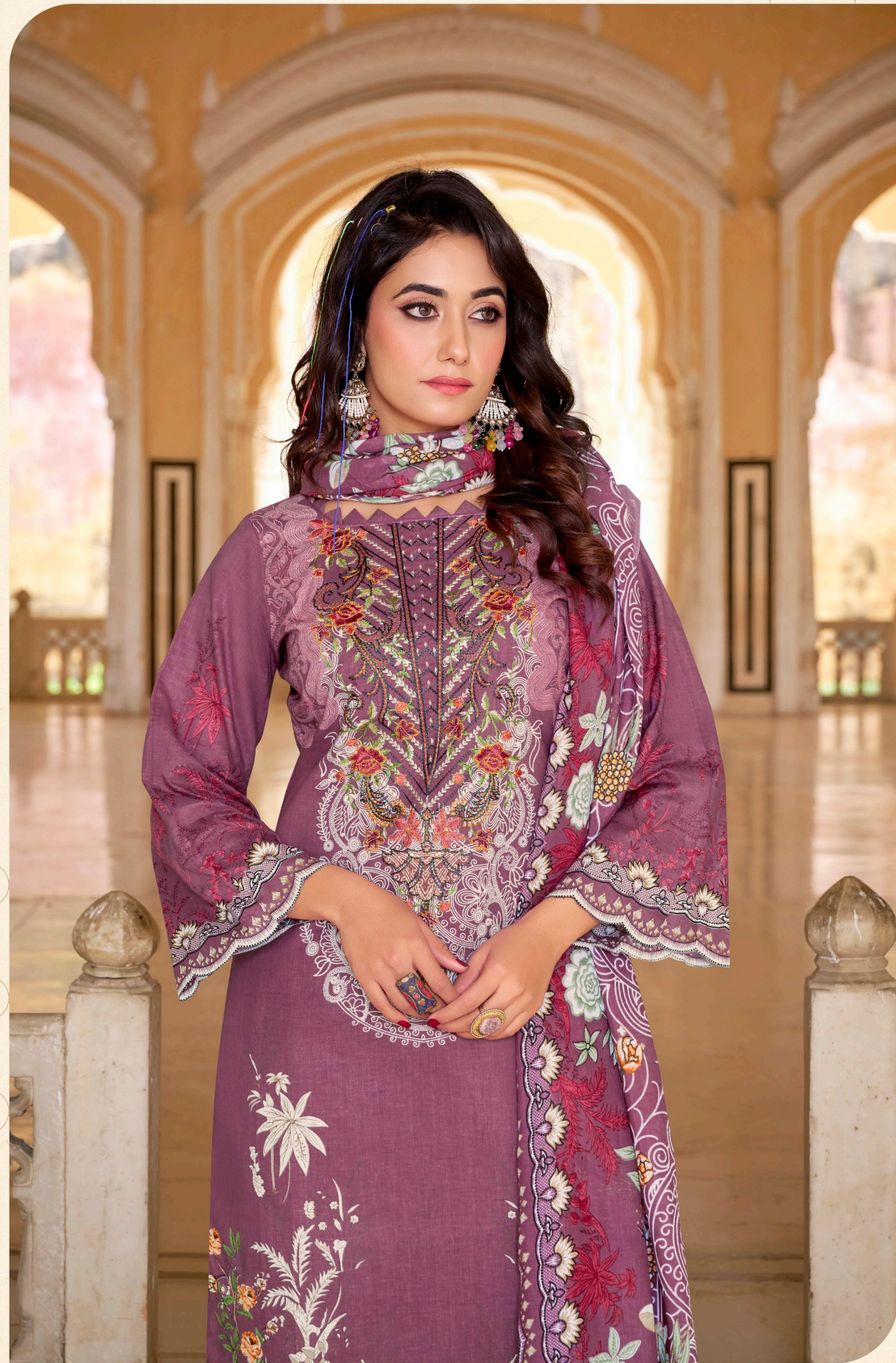
The gorgeous combination of geometrical design with young charming colours.