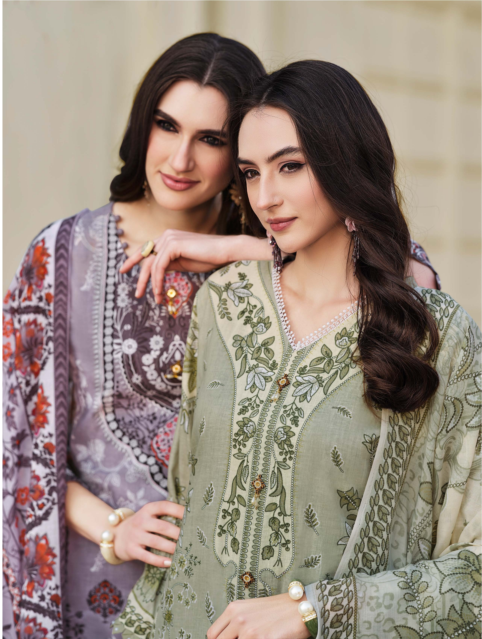
"The best things in life are free. The second best are very expensive."