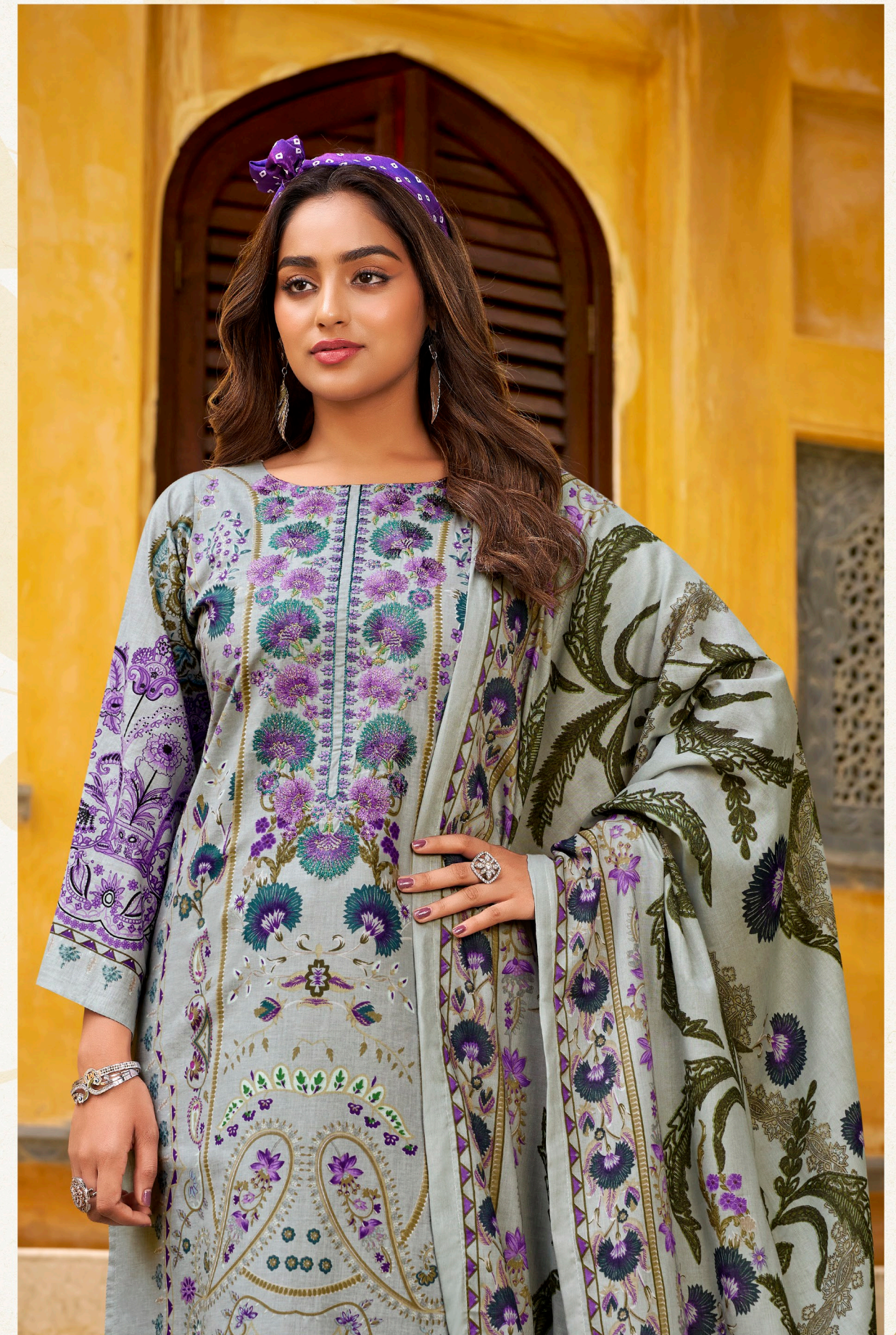
Superbly designed to provide an unmatched aura to your natural grace. 899-008