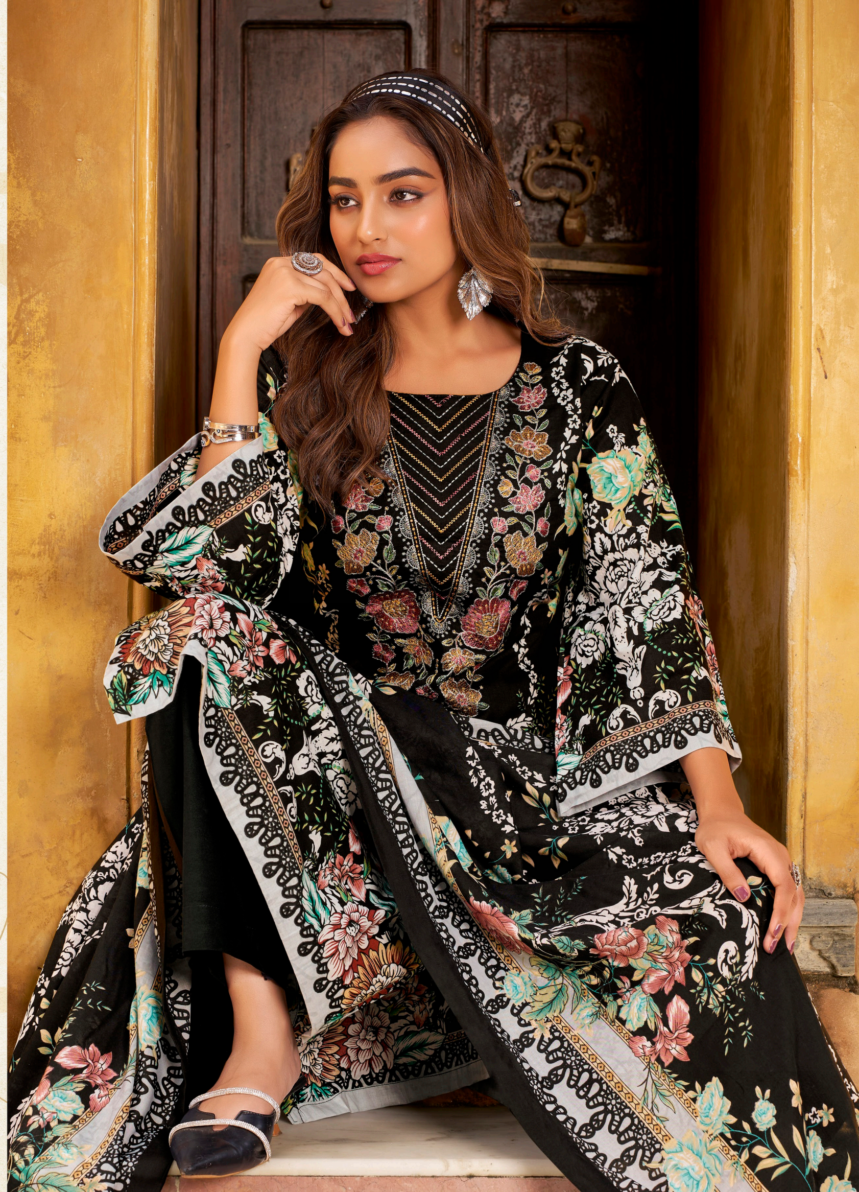
899-002 A graceful design that makes u look a complete woman.