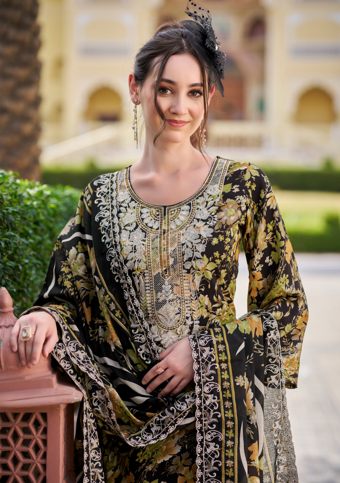
Threads of tradition, woven with today's soul.