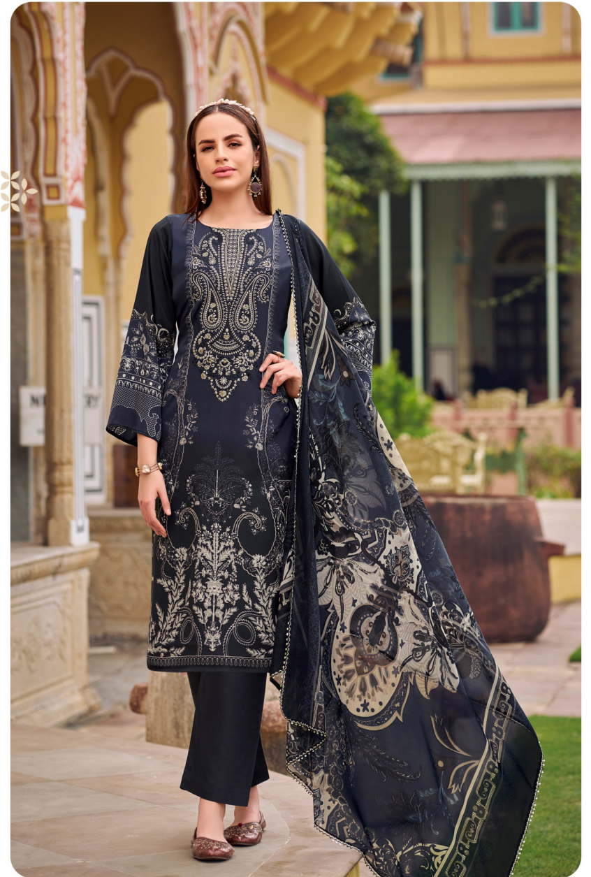
SPARK AND SHINE