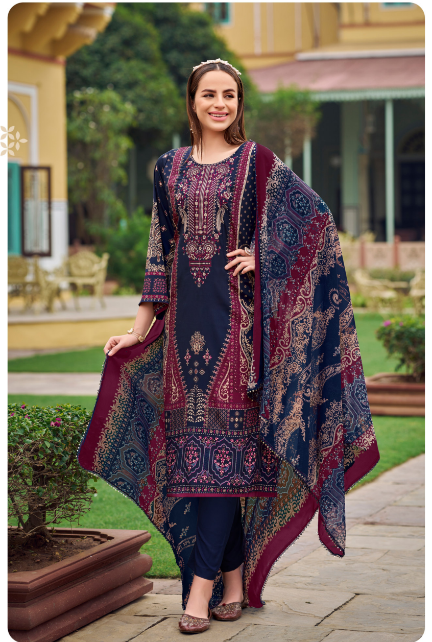
AN ENDURING LEGACY OF GLAMOUR