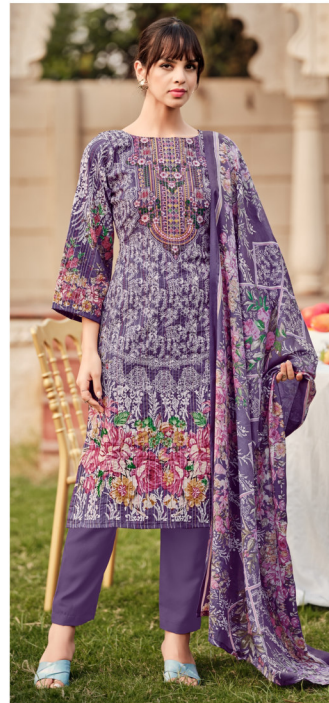
• 1099-004 •