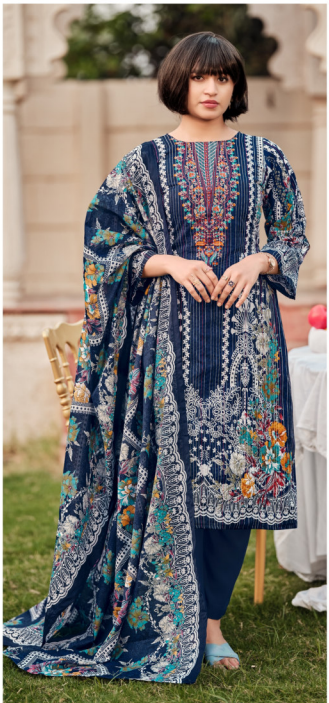
• 1099-005 •