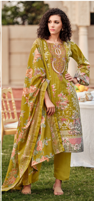
• 1099-003 •