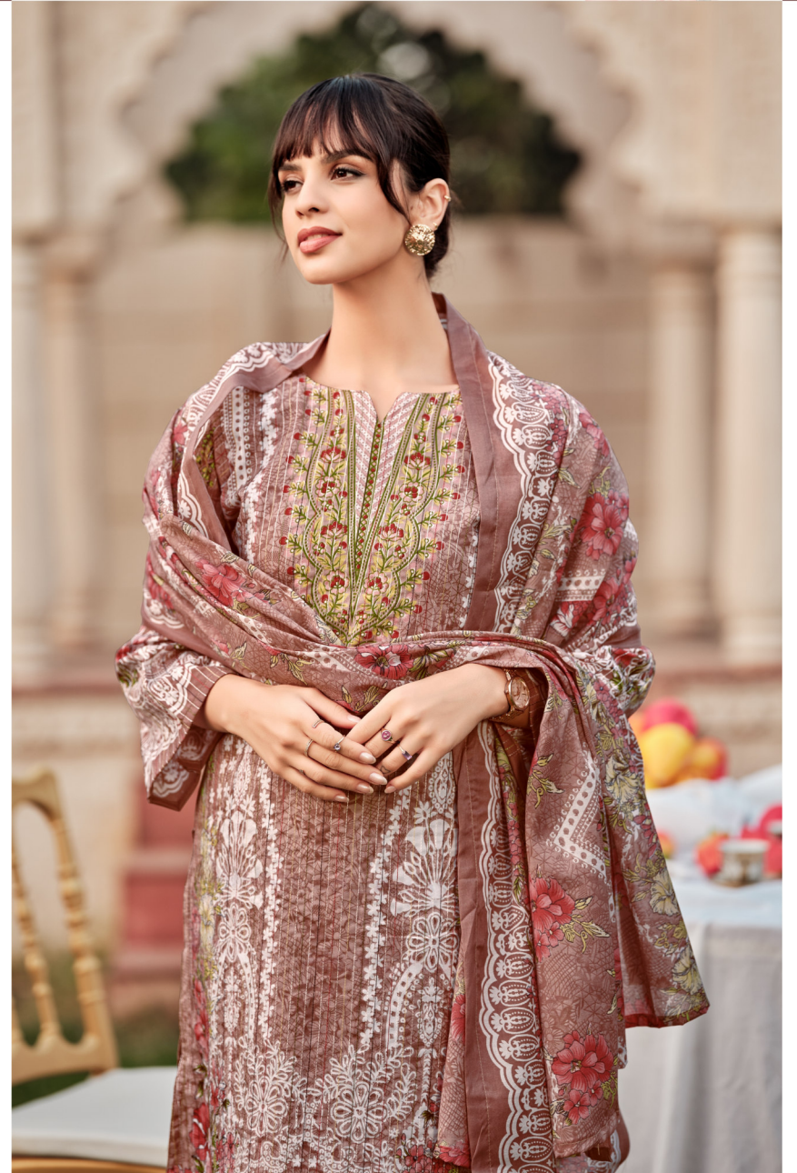
Handcrafted with Love, Inspired by Heritage.