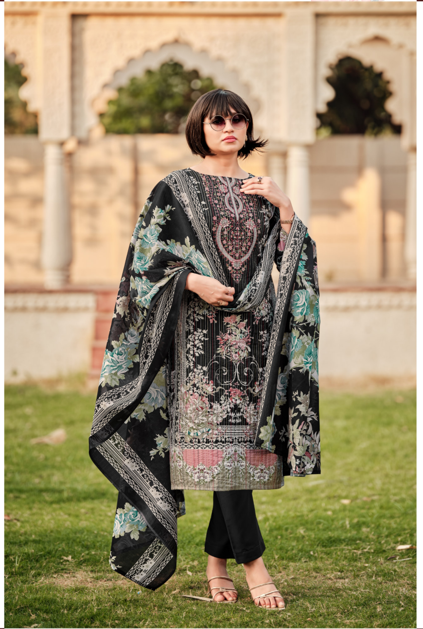
From Petals to Prints - The Magic of Fashion