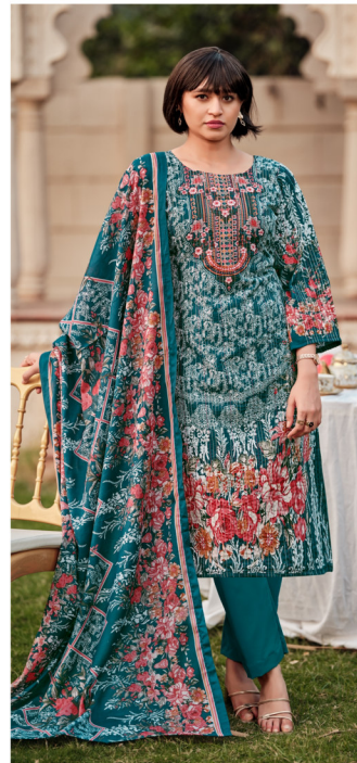
• 1099-008 •