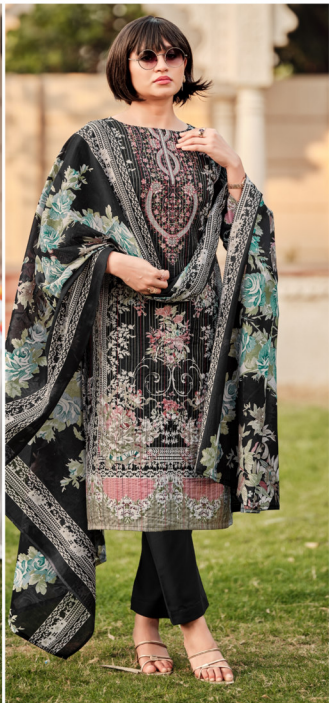
• 1099-007 •