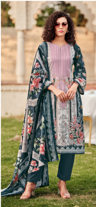
• 1099-002 •