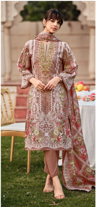
• 1099-001 •