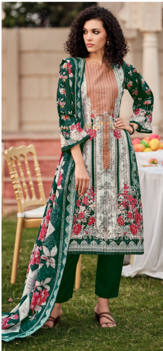
• 1099-006 •