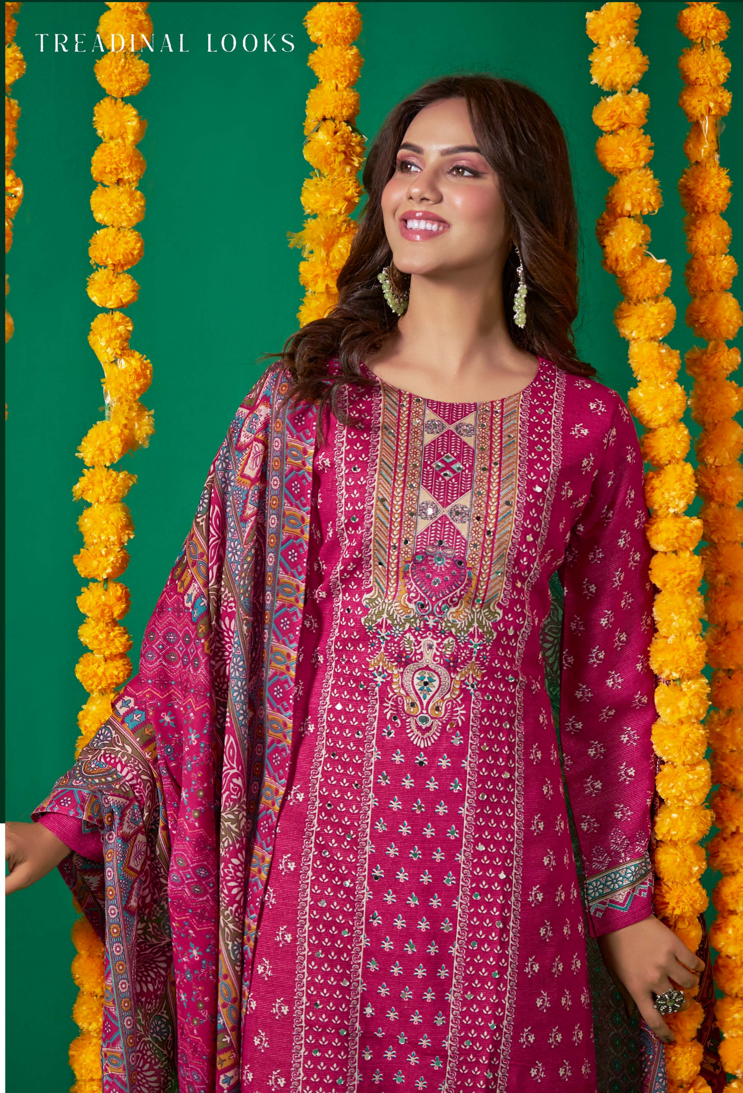
611-004 "What you wear is how you present yourself to the world, especially today, when human contacts are so quick. Fashion is instant language."