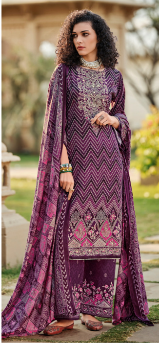
• 1043-002 •