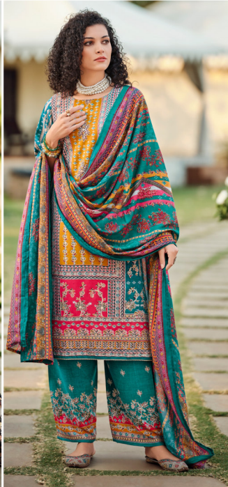
• 1043-007 •