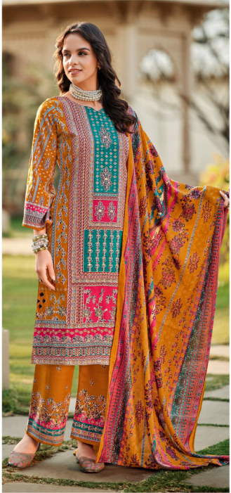
• 1043-001 •