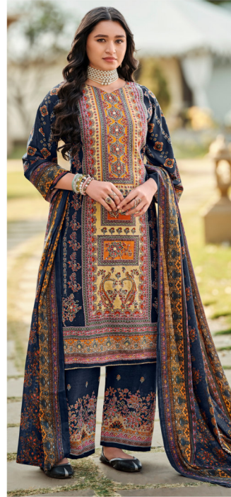
• 1043-004 •