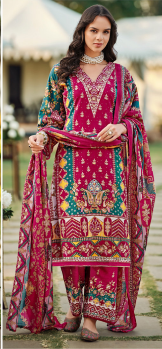
• 1043-003 •