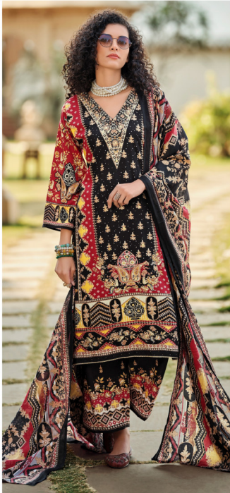
• 1043-006 •