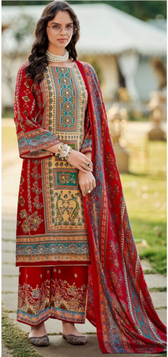
• 1043-005 •