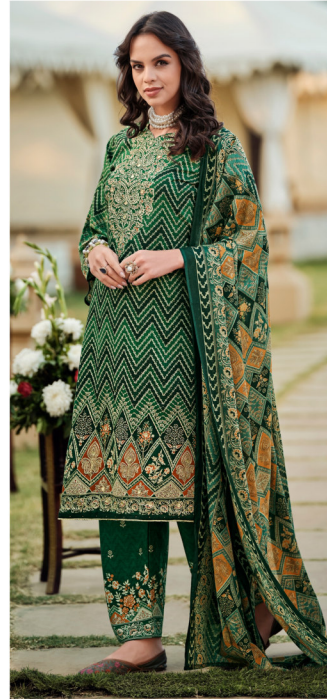
• 1043-008 •