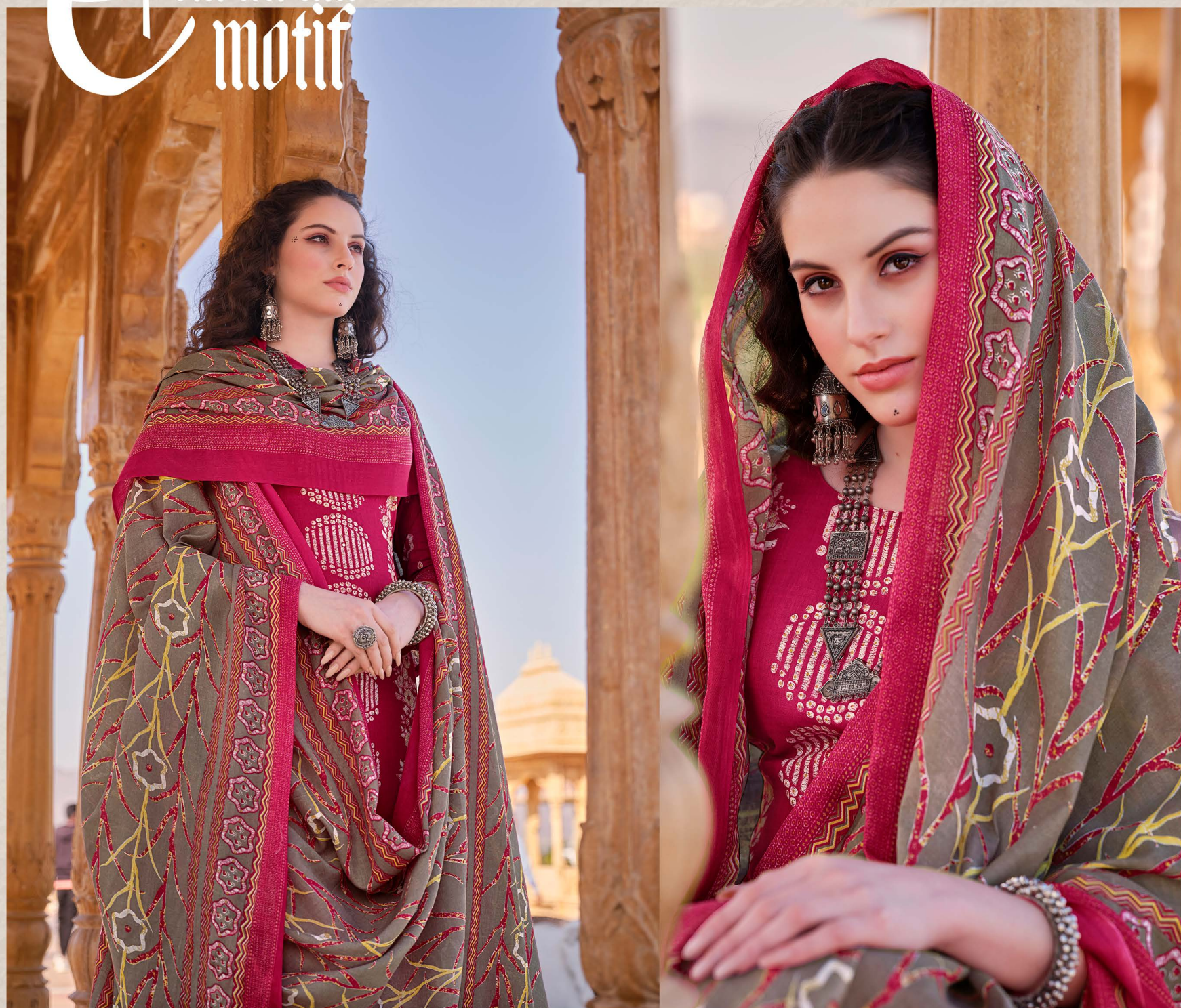
Indian fashion from traditional motifs to customary essential hints of folk and vibrant regional colours.