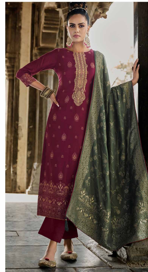
830-004 ■ ■ ■