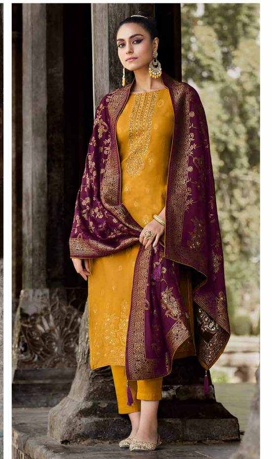
830-006 ■ ■ ■