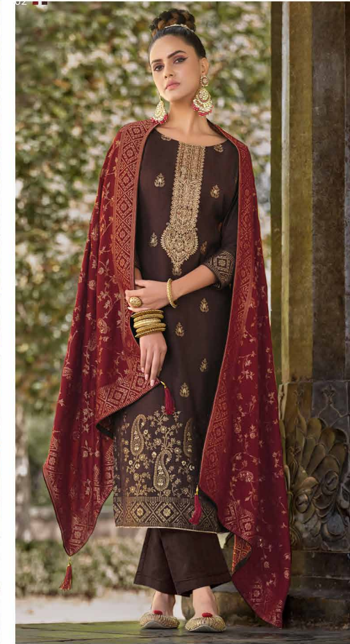
830-002 ■ ■ ■