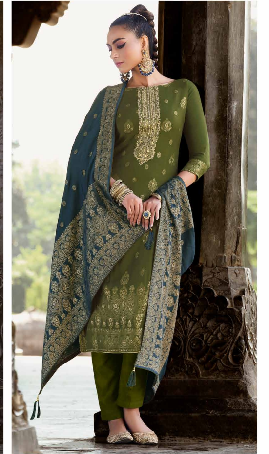
830-003 ■ ■ ■