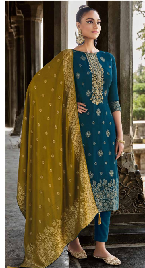
830-001 ■ ■ ■