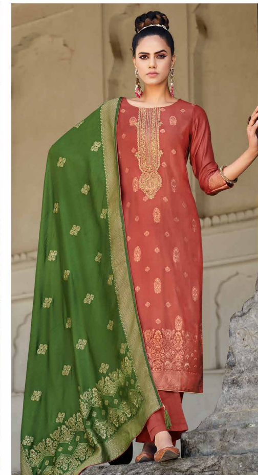
830-005 ■ ■ ■