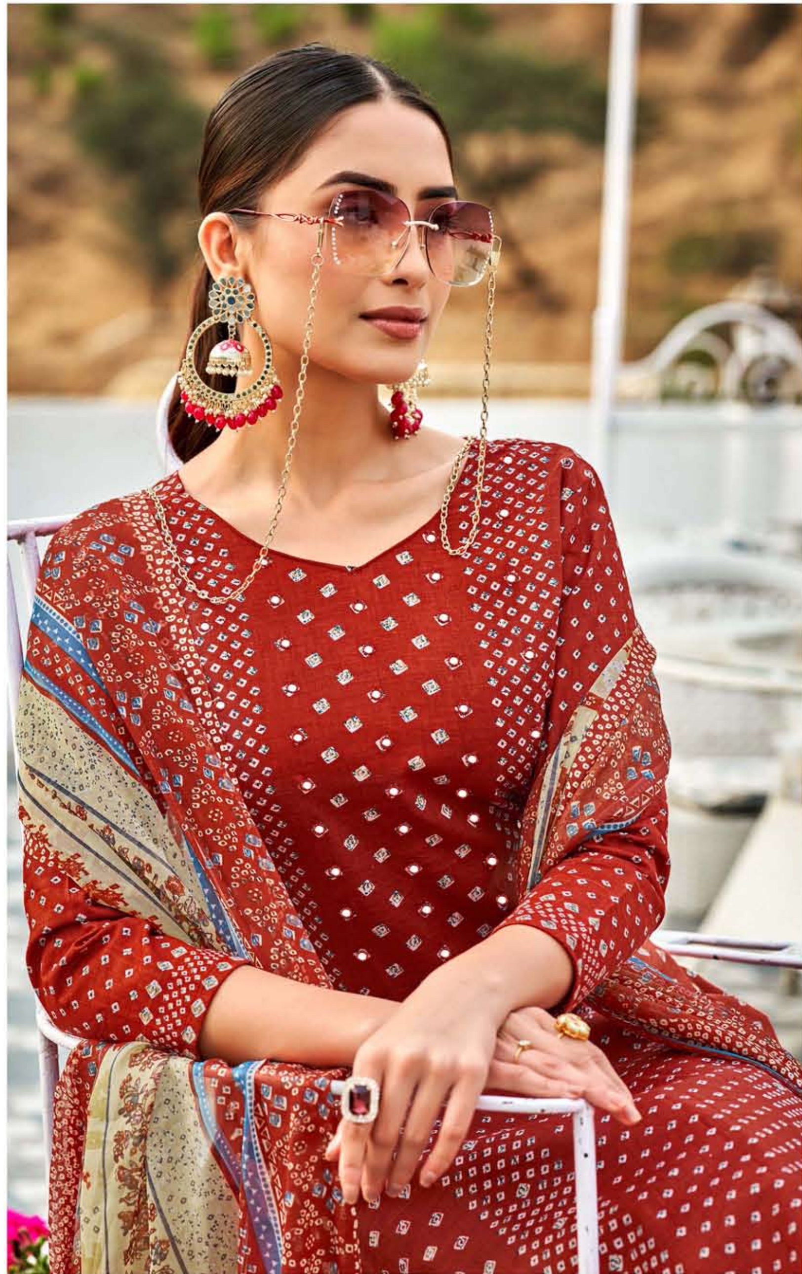
Celebrate your classy side with this perfect Collection of this printed designer style.