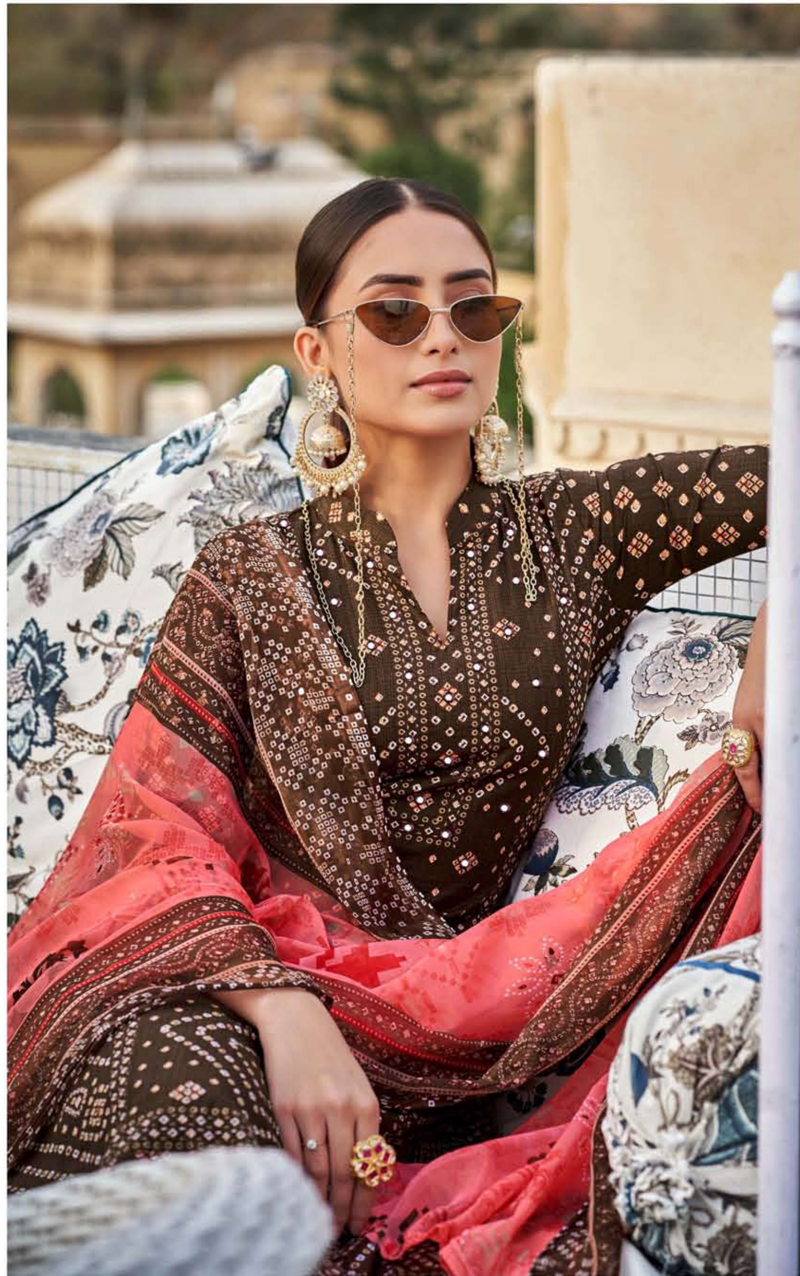
Celebrate your classy side with this perfect Collection of this printed designer style.