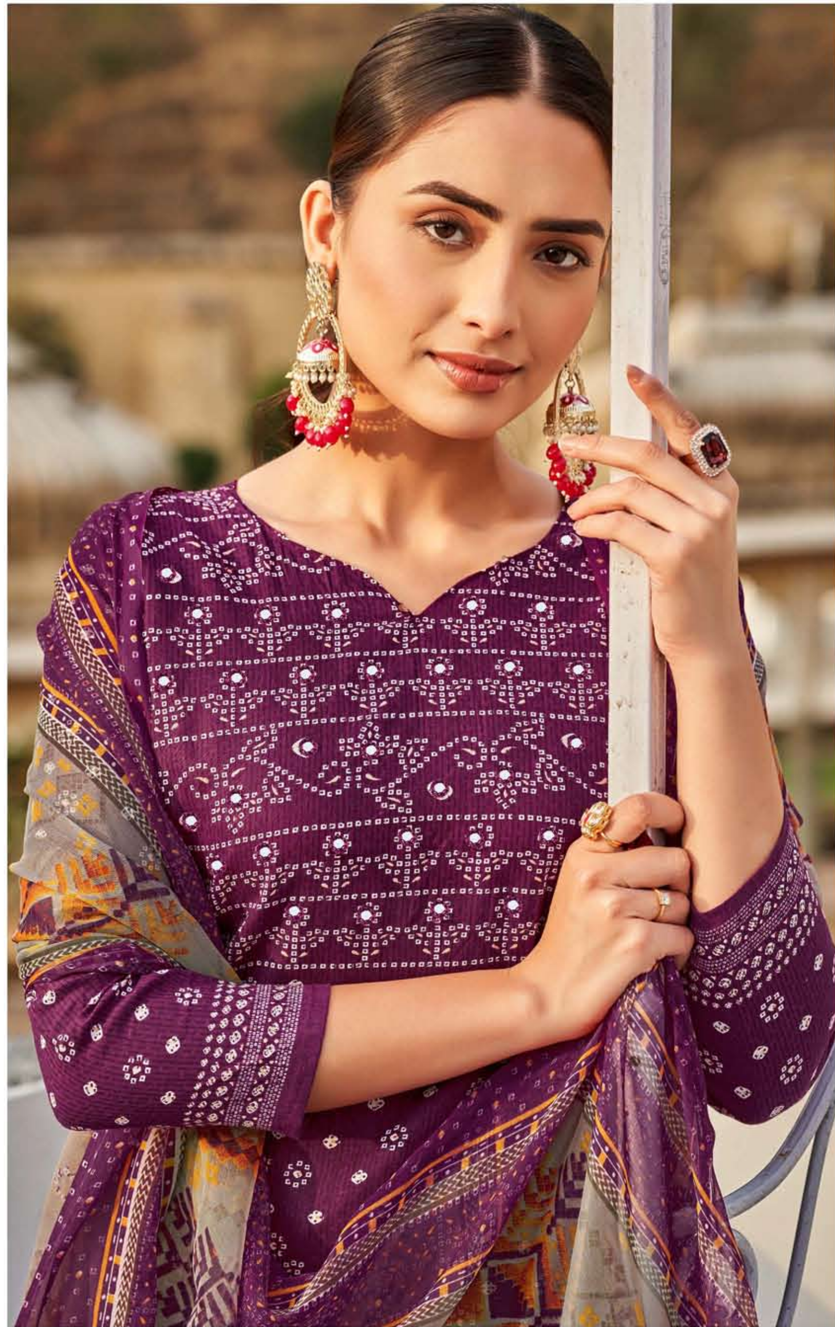
Celebrate your classy side with this perfect Collection of this printed designer style.